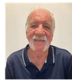
Glen Hall Villa 15

Every day living here is another day in paradise.